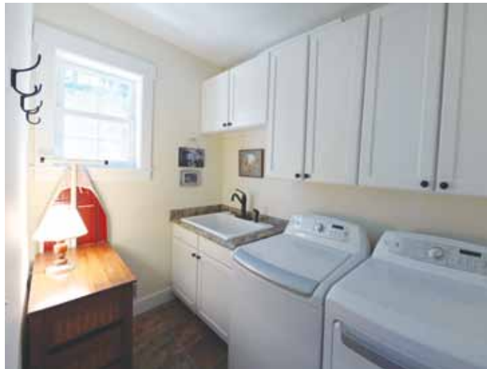
ABOVE: After occupying the home, an entrance/ mud room was added for additional storage and easier access to the garage.